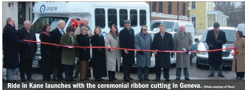
Ride in Kane launches with the ceremonial ribbon cutting in Geneva.

January 25th marked the launch of a new public transportation program for Kane County called “Ride in Kane.” The Kane County Paratransit Coordinating Council rolled out the new program that unites all of the county's dial-a-ride programs under one organization.